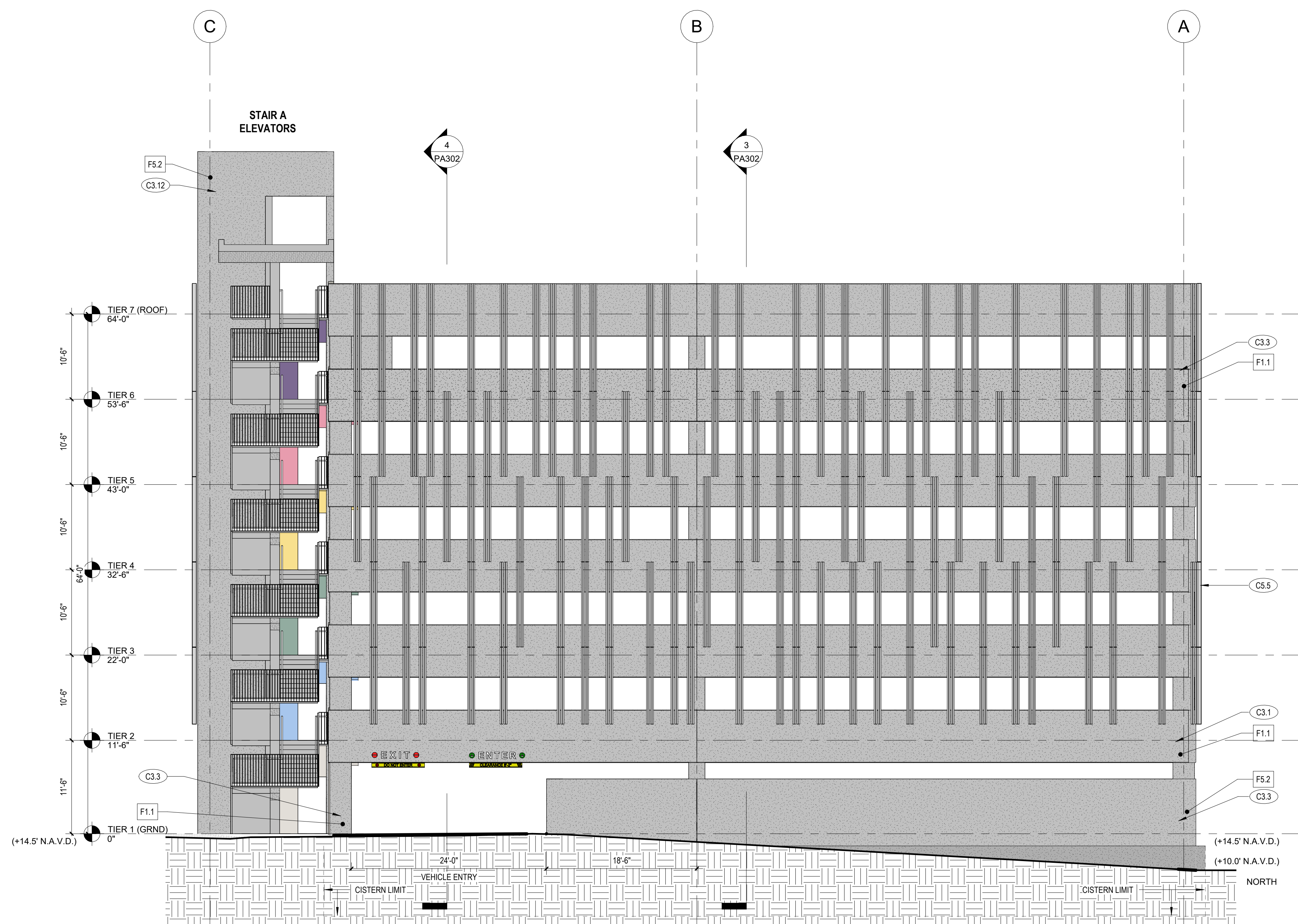
1 EAST ELEVATION 1/8" = 1'-0"